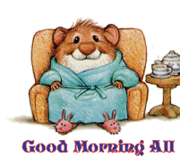
Good Morning All

MORNING PRAYER: O Jesus, through the Immaculate Heart of Mary, I offer you my prayers, works, joys, and sufferings of this day for all the intentions of your Sacred Heart, in union with the sacrifice of the Mass throughout the world, in thanksgiving for your favors, in reparation for my sins, for the intentions of all my relatives and friends, and particular for the intentions of the Holy Father. Amen.